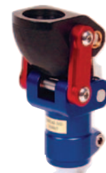
MightyMite® 4-bar knee for geriatric and pediatric patients

Another locking approach is the weight-actuated stance-control knee, originally known as the "safety knee." This unit functions as a constant-friction knee during leg swing but is held in extension by a braking mechanism as weight is applied during stance phase.