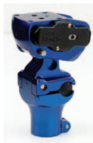
GeoFlex™ polycentric knee