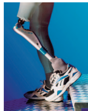
'Smart' knees like the C-Leg® help amputees with life's ups and downs.

In real time the decision-making chip signals the swing-phase control to react so the limb will be ready for heel strike at the appropriate instant and place. Then at heel strike, the microprocessor signals the knee to restrict flexion until late stance phase, providing needed stability for full weight-bearing, then gradually allows flexion in preparation for toe-off. Smart knees can further detect danger of falling or slipping and react to keep the knee from contributing to a fall.