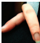
Lifelike silicone restoration